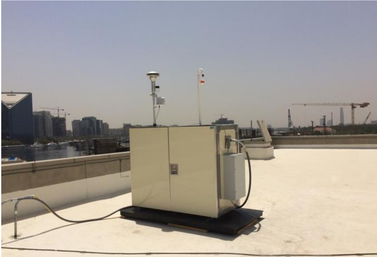
Air monitor picture 1.