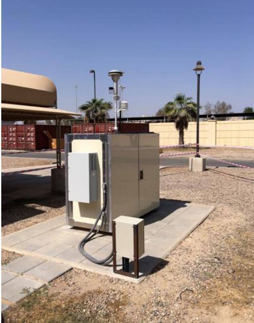
Air monitor picture 2