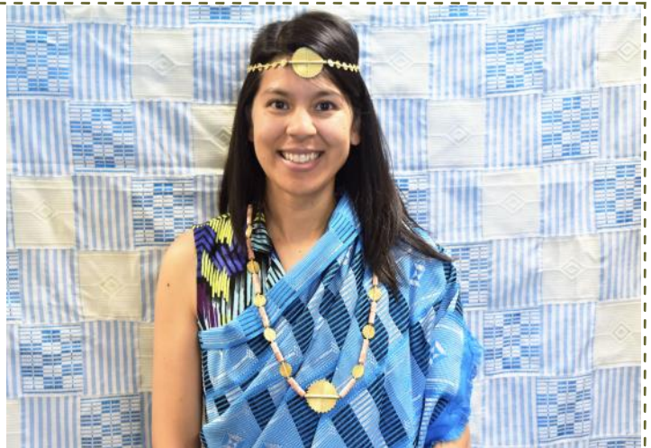
PEPFAR country team.